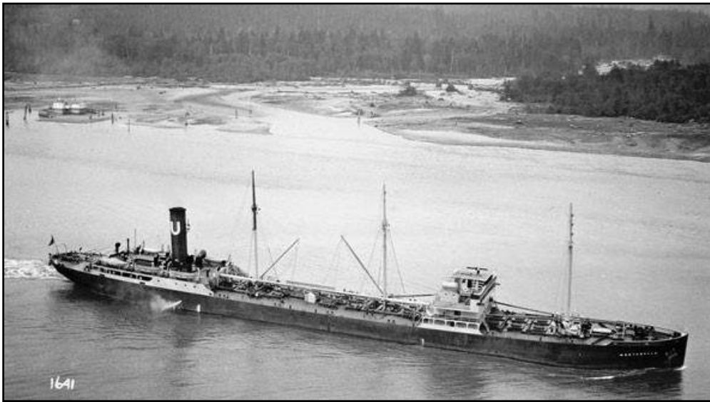
The SS Montebello.

Another great source of information on the sinking of the Montebello is the NOAA website: https://montereybay.noaa.gov/maritime/frmontebello.html .