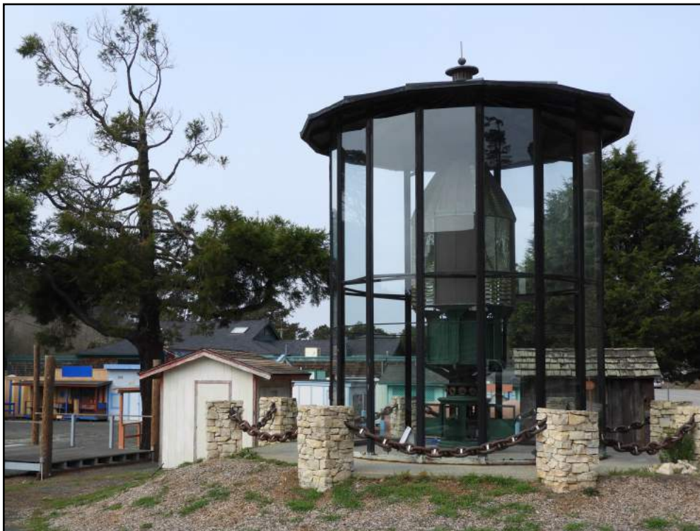
The Piedras Blancas Light Station Fresnel lens in Cambria, 2021.

Conversations have begun in earnest about the future of the historic Piedras Blancas Light Station First Order Fresnel Lens currently on display in Cambria next to the Pinedorado grounds. The lens was removed from the PBLS lighthouse tower in 1949, then placed on display in Cambria. The current enclosure on Main Street was completed in 1994. The lens belongs to the United States Coast Guard, and the USCG lease to the current caretakers, the Cambria Lions Club, expired in March, 2021. Since the Lions Club is not interested in renewing the lease, the BLM, with the support and the participation of the PBLSA, has been discussing the future of the lens with the Coast Guard.