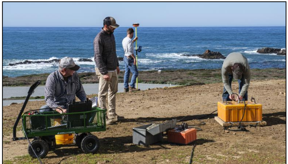
Working with ground penetration sensors for seismic testing.

Funding for the exploratory phase and engineering reports was provided by the Piedras Blancas Light Station Association.