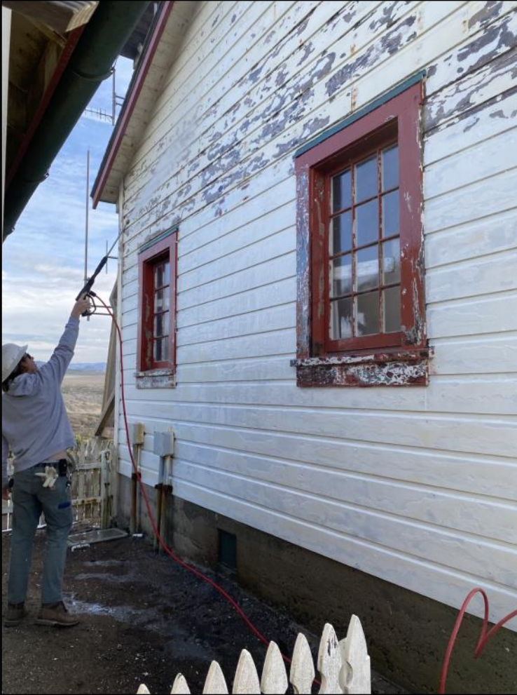
An ACE crew member pressure washes the side of the tank house to prepare it for painting.

ACE work crews spent nearly a month working at the light station,