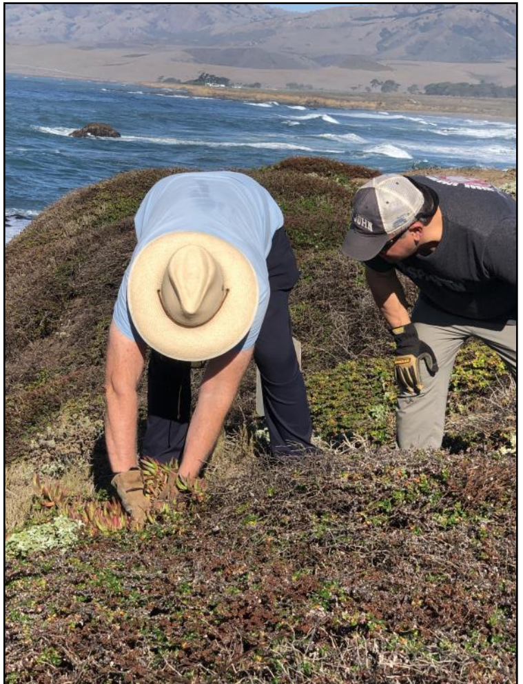
Members of the Sierra Club remove invasive ice plant.

Thank you to everyone for your hard work preserving the historic buildings and natural landscape of Piedras Blancas! We couldn't do it without you!