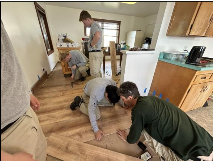
The AmeriCorps team lays new flooring in Unit B.

beginning in November and returning in December. In November, they trimmed the entire trail, removed carpet from Coast Guard Unit B, and began prepping the gift shop for painting. In December, they returned to continue painting the gift shop and the tank house, as well as painting in the lighthouse rotunda. In March, another ACE work crew focused on trail work and clearing weeds throughout the historic district near the gift shop.