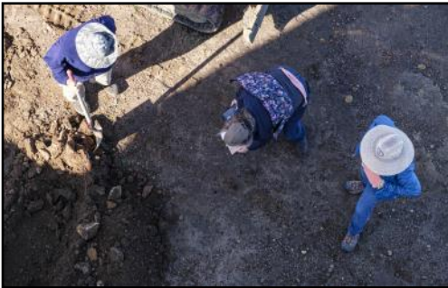
BLM archaeologists check for artifacts in the dirt dug up next to the tower foundation.

In order to provide further information, geotesting was conducted by Yeh & Associates, starting on February 22 with the digging of test pits next to the tower to ascertain the depth of the foundation. When the tower was built in 1874, the foundation construction deviated from the plans due to the hardness of the rock the lighthouse builders encountered.