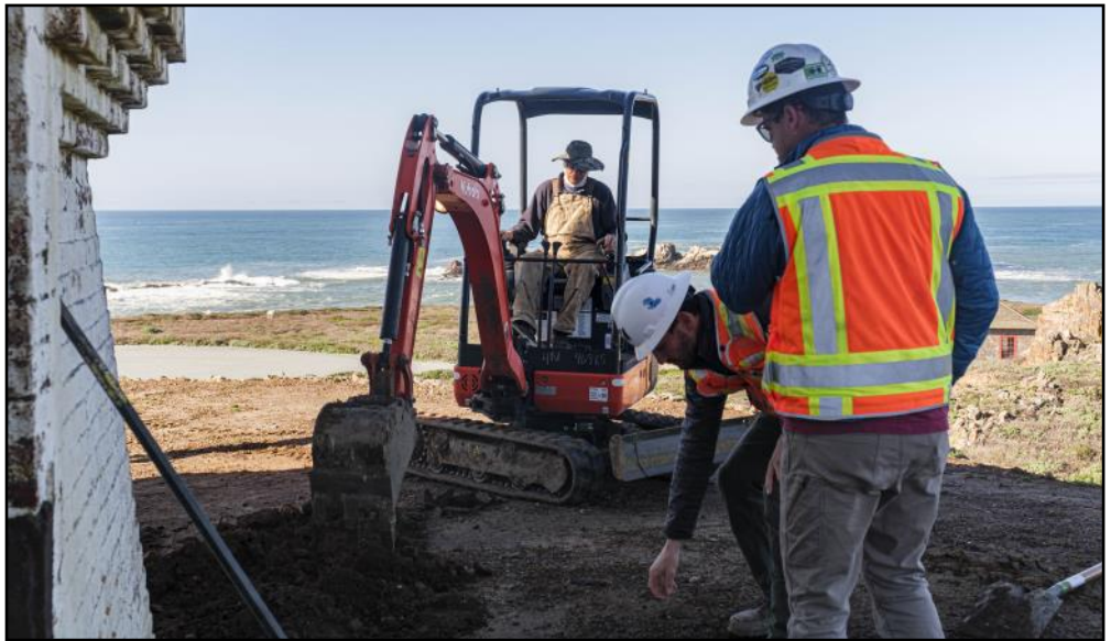
Digging a trench next to the lighthouse foundation.

The second phase of geotesting was seismic testing using ground-penetrating radar on February 27. The results of this testing will determine what will be necessary to protect the lighthouse from further earthquake damage.