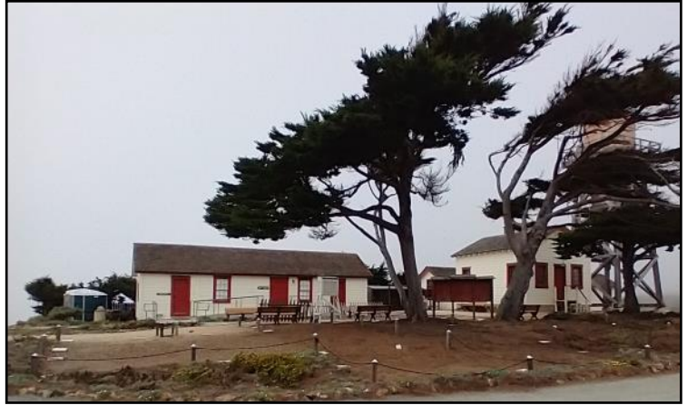
Posts and rope outline the site of the duplex keepers' house today.