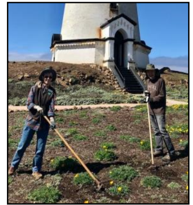
Volunteers clear plants in front of the lighthouse to make room for seaside poppies.

Would you like to help preserve a historical landmark while enjoying beautiful coastal scenery? We currently have a need for volunteers in multiple roles. Are you interested in delving into the history of the light station and sharing that information with our visitors, or would you prefer to help in the gift shop? Some volunteers like working on restoration projects or helping with native plant rehabilitation, while others help out with Friday-morning school tours. Whatever your interests, we'd be glad to have your help. If you'd like more information about volunteering at the light station, contact Jodie Nelson, our Outdoor Recreation Planner, at PiedrasBlancasTours@gmail.com .