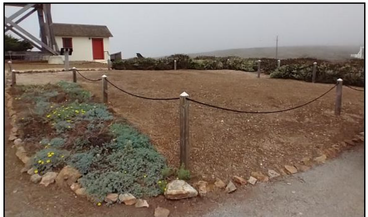
The site of the head keeper's cottage today.