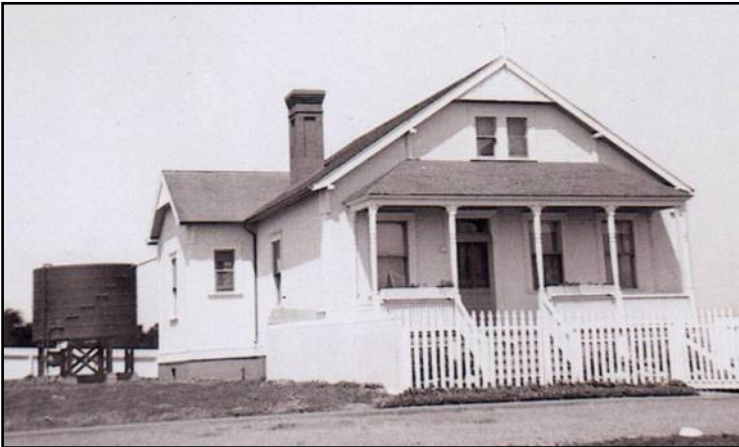
Head keeper's cottage, 1940s.