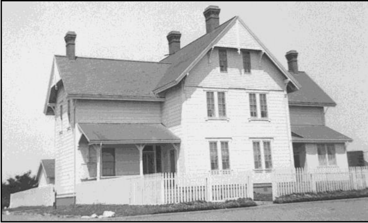
Duplex keepers' house 1910.

A committee of Piedras Blancas Light Station Association board members and BLM staff, with the assistance of a generous anonymous donor, has started the planning process to reconstruct the Victorian-era keepers' houses as part of the overall plan to restore the light station to its period of greatest historical significance.