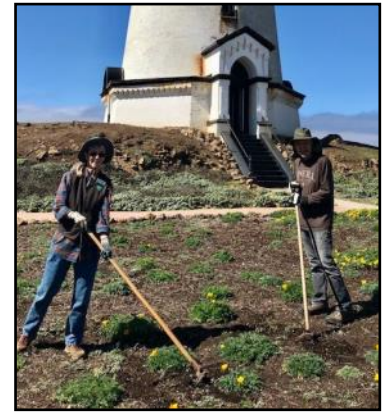
Volunteers clear plants in front of the lighthouse to make room for seaside poppies.

Would you like to help preserve a historical landmark while enjoying beautiful coastal scenery? We currently have a need for volunteers in multiple roles. Are you interested in delving into the history of the light station and sharing that information with our visitors, or would you prefer to help in the gift shop? Some volunteers like working on restoration projects or helping with native plant rehabilitation, while others help out with Friday morning school tours. Whatever your interests, we'd be glad to have your help. If you'd like more information about volunteering at the light station, contact Jodie Nelson, our Outdoor Recreation Planner, at PiedrasBlancasTours@gmail.com .